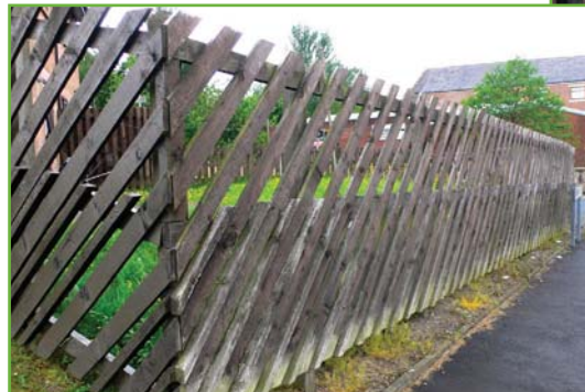
Before installation of recycled plastic fencing and after.

Kedel fencing makes architecturally pleasing boundaries with the add-on benefits of long life and no painting or staining. It's becoming an increasingly favoured option to transform local communities with organisations such as local authorities and housing associations.